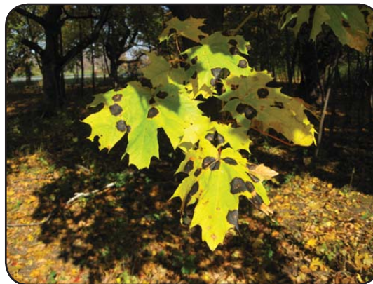
maple leaves with tar spot disease

They endured heavy equipment; foot traffic; frost cracks; tar spot disease (caused by a fungus); all kinds of borers, beetles, and other insects; woodpeckers; and the many hazards of urban living. Unfortunately, it will be very easy for you to find dead branches, broken limbs, and fallen trees on your walk.